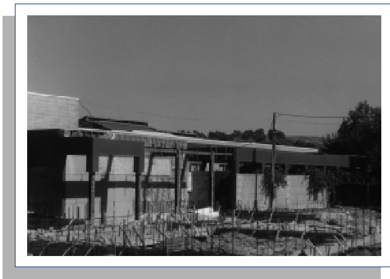
The Beckman Laser Institute's Photonic Incubator expansion will be completed this winter.

“It was exciting to work with these young collaborators,” he said. “It also was in keeping with the Institute’s mission to educate the next generation of scientists.” ■