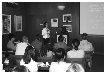
B-SURP students listening to a lecture at Beckman Laser Institute as part of their training experience.